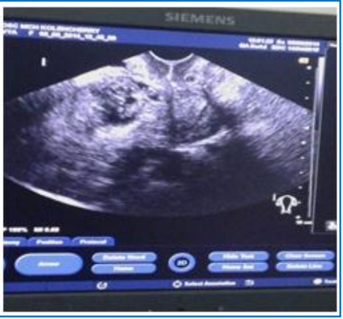
Fig. 5: Post KCl injection with crumbled sac

We could see the FH disappearing with KCl injection (Fig. 5). MTX /folinic acid rescue regime started the next day after doing basic blood investigation. She was followed up with \beta HCG and USG. Follow up ultrasound revealed heteroechoic mass with peripheral vascularity. She received 2 courses of methotrexate at 2 weeks interval. 3 months after starting chemotherapy \beta HCG became normal (Table 2) and mass reduced considerably in size with no vascularity in 5 months' time (Fig. 6).